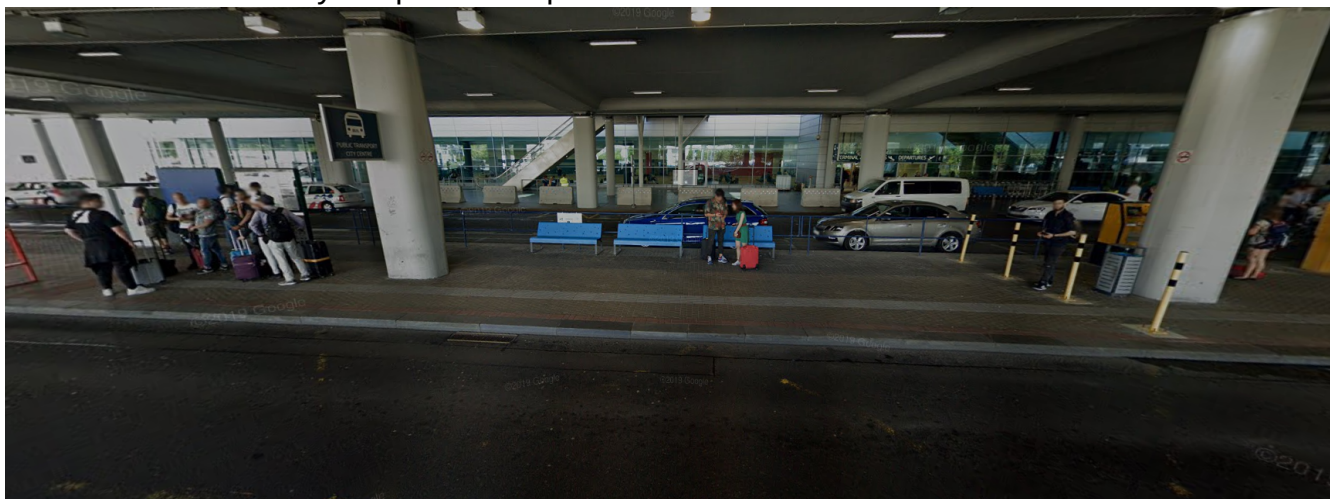
Airport bus stop to city center, yellow ticket machines on the left

On the ground level of the arrivals terminal you will find bus 119 which connects the airport to “Nádraží Veleslavín” metro station (bus line terminus) at the A Line (Green) from where you can enter the city metro. Bus tickets can be purchased at the stands inside the terminals or at the ticket machines at the bus stops. For the costs of the public transport ticket, see below. You can also use taxi (Taxi Praha or AAA Taxi) the stands of which are located at the Terminals 24/7. Standard price for going to the city center is 20–25 EUR. Ridesharing apps such as Uber and Bolt are available at the airport with prices varying depending on demand; they will pick you up on the top floor outside of the arrivals exit.