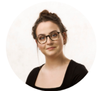
EMMA (Netherlands) Dutch Ministry of Foreign Affairs