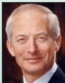
Prince Hans-Adam II (Patron)