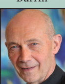
Mr Pascal Lamy

"I have no doubt that when the Europaeum shows the way, many will see it." – Viviane Reding, Education Commissioner, 2001