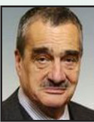
H.E. Karel Schwarzenberg