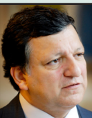
Professor J M Barroso