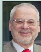
Dr Erhard Busek