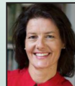
Professor Ngaire Woods