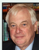
Lord Patten (Chair)